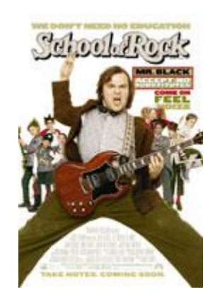
School of Rock Saturday, September 14, 2013 – 11:00 a.m. local time

Megamind is the most brilliant supervillain the world has ever known, and the least successful. Over the years, he has tried to conquer Metro City in every imaginable way. Each attempt, a colossal failure thanks to the caped superhero known as "Metro Man," an invincible hero until the day Megamind actually kills him in the throes of one of his botched evil plans. Suddenly, Megamind has no purpose. A supervillain without a superhero. He realizes that achieving his life's ambition is the worst thing that ever happened to him. Megamind decides that the only way out of his rut is to create a new hero opponent called "Titan," who promises to be bigger, better and stronger than Metro Man ever was. Pretty quickly Titan starts to think it's much more fun to be a villain than a good guy. Except Titan doesn't just want to rule the world, he wants to destroy it. Now, Megamind must decide: can he defeat his own diabolical creation?